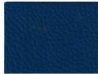
Steel Blue 03796