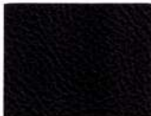
Dark Burgundy 03791