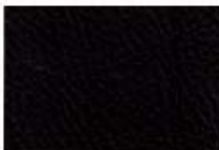
Dark Brown 01444