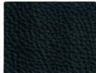
Bottle Green 03790